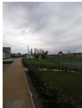
In early December (since the photos) there have been added a number of outdoor benches and tables